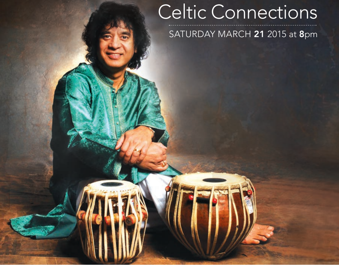
Tabla master and Chan Centre favourite Zakir Hussain is widely celebrated for his genuinely creative East/West musical dialogues with the likes of Mickey Hart, Béla Fleck, John McLaughlin and Charles Lloyd. The virtuoso percussionist developed his Celtic Connections: The Pulse of the World project to open Glasgow's annual Celtic music festival.