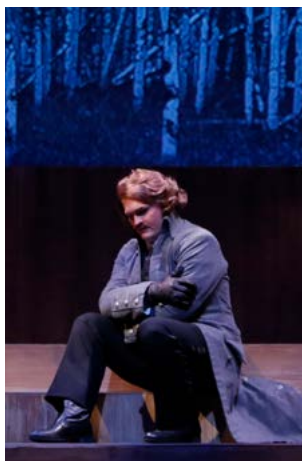
OPERA EXCERPTS CONCERT SATURDAY, MARCH 26, 2022 — 7.30 P.M. SUNDAY, MARCH 27, 2022 — 2 P.M.