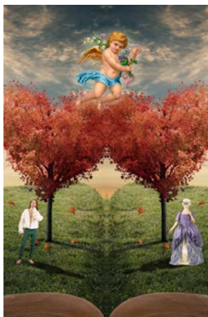
WOLFGANG AMADEUS MOZART LE NOZZE DI FIGARO JAN 29, FEB 3, 4, 5, 2022 — 7:30 P.M. JAN 30, FEB 6 — 2:00 P.M. | 2022