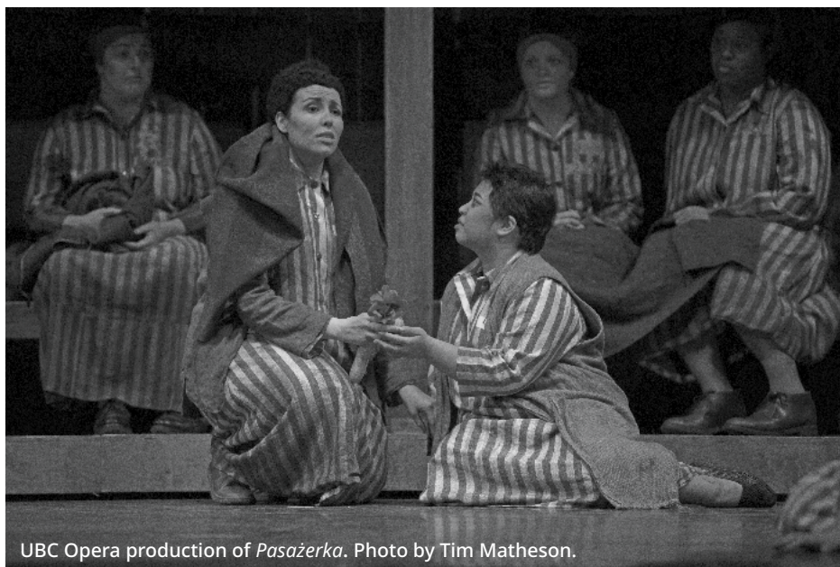
UBC Opera production of Pasazierka.