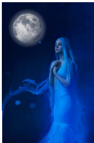
ANTONÍN DVOŘÁK RUSALKA JUNE 23, 24, 25 — 7:30 P.M. JUNE 26 — 2:00 P.M. | 2022