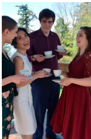
OPERA TEAS SUNDAY, NOVEMBER 28, 2021 | 2 P.M. OLD AUDITORIUM SUNDAY, APRIL 10, 2022 | 2 P.M. UBC BOTANICAL GARDEN

More details on performing dates and locations can be found at ubcopera.com