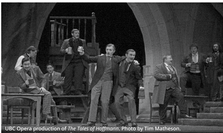
UBC Opera production of The Tales of Hoffmann.