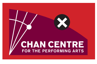
DO NOT PLACE UPON CLASHING COLOUR (USE B+W VERSION)